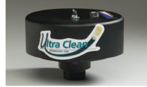
Steel construction models, like the one shown here, are available for very corrosive and high temperature applications with air flow rates up to 300 CFM.

Our breathers help guard against multiple contaminants to protect expensive equipment and reduce maintenance costs.