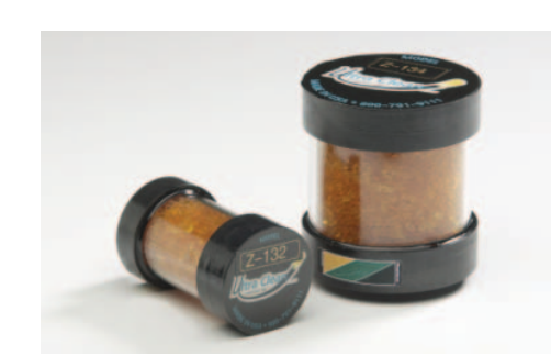
Ultra Clean Breathers are manufactured under an ISO 9001 Certified Quality System.