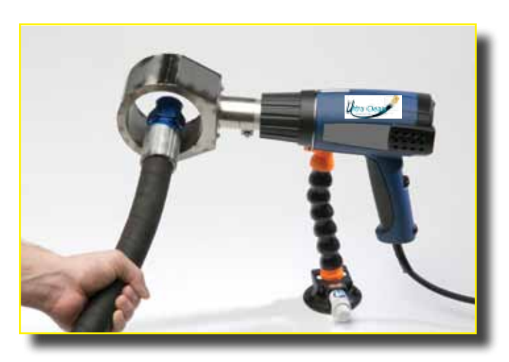
Pictured here: UC-HL1910E Heat Shrink Gun with UC-HG-Stand and UC-1.5HD Diffuser. Sold separately.